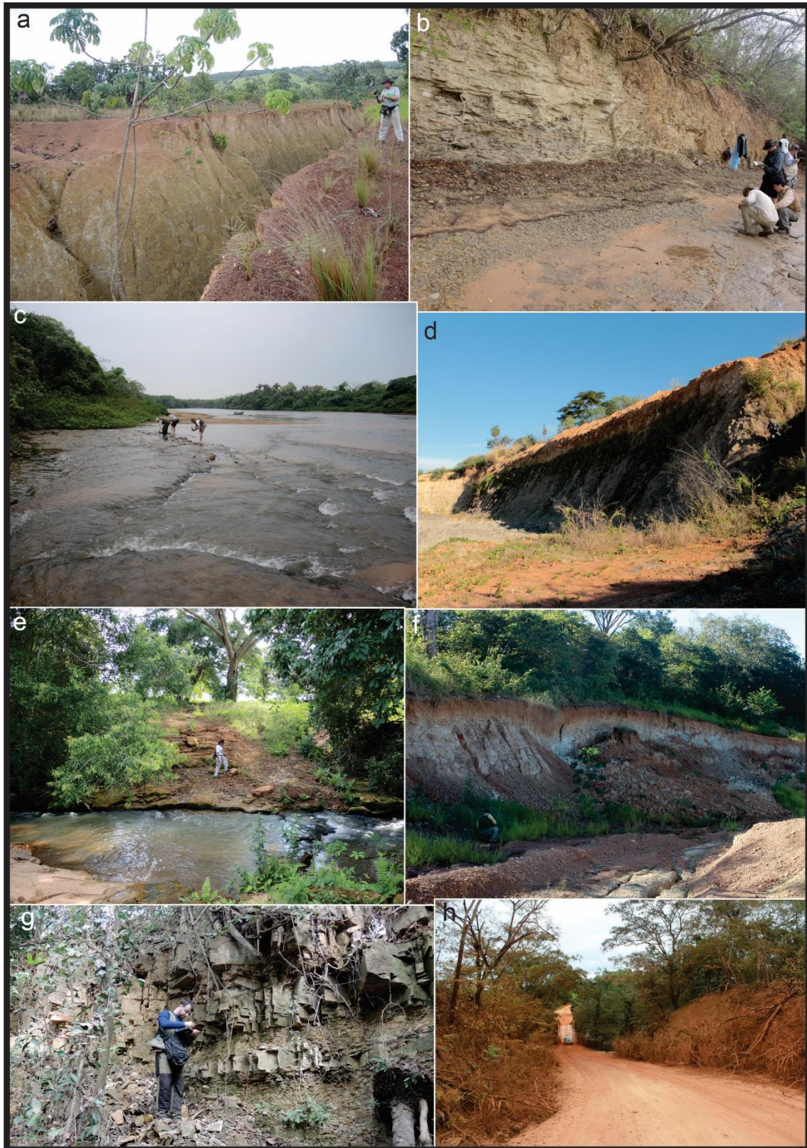
Figure 3: Devonian outcrops in Mato Grosso do Sul. a – MS 75 (Rio Verde de Mato Grosso), MS 65 (Coxim), c – MS 54 (Coxim), d – MS 28 (Rio Verde de Mato Grosso), e – MS 64 (Pedro Gomes), f – MS 39 (Coxim), g – MS 24 (Rio Verde de Mato Grosso), h – MS 19 (Rio Negro).