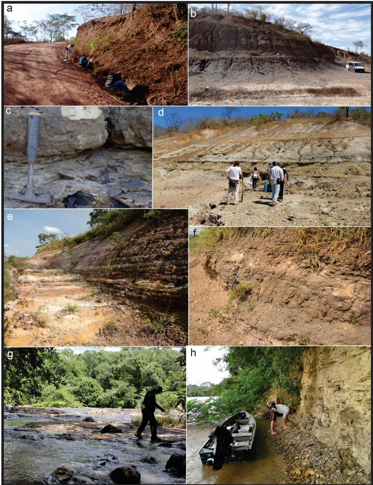
Figure 2: Devonian outcrops in Mato Grosso do Sul. a – MS 18 (Estrada da Ponte Nova, Rio Negro), b – MS 30 (Barreiro da Figueira, Rio Verde de Mato Grosso), c – MS 70 (Corredeira da Benedita, Coxim), d – MS 46b (Fazenda Torrão de Ouro, Pedro Gomes), e – MS 14 (Estância Nhecolândia, Rio Negro), f – MS 58 (Pedro Gomes), g – MS 82 (Rio Negro), h – MS 72 (Coxim).